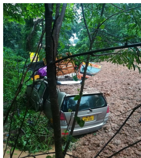
Fig C: Vehicle stuck in a landslide in Wayanad district

Many of the affected lost all of their livelihoods. Minor depressions and PTSD cases were reported, but also suicides. A quick return to normality and a recuperation of livelihoods were seen as essential to mitigate long-term mental health problems.