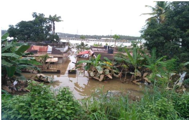
Fig B: Flooded homes in Kuttanad Region-Kerala

The 2018 Kerala Floods (Fig.B) were the worst in the region since 1924. Between August 7th and 20th, 504 people died and 23 million were directly affected by these flash floods. Economic losses accounted for 2.85 billion US$, the third costliest flood in India. This disaster also damaged or destroyed 110,000 houses, and deeply affected people's livelihoods, with more than 60,000 ha of culture damaged and many animals killed. Finally, these floods damaged more than 130 bridges and 83,000 km of roads, causing the isolation of certain communities.