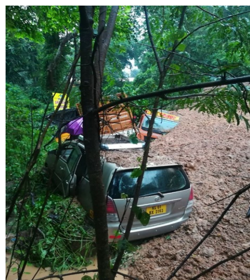
Fig C: Vehicle stuck in a landslide in Wayanad district

Many of the affected lost all of their livelihoods. Suicides were reported along with minor depressions and PTSD cases. A quick return to normality and a recuperation of livelihoods were seen as essential to mitigate long-term mental health problems.